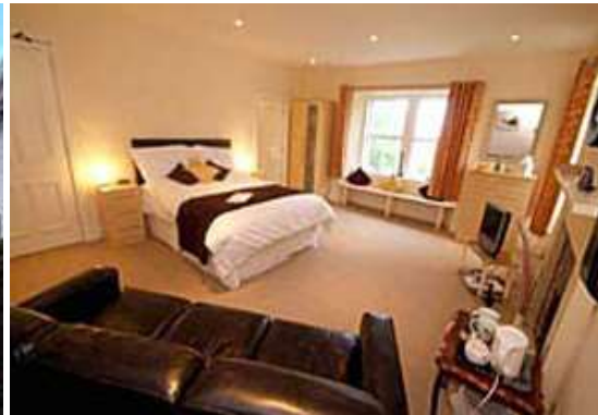
Isle of Skye